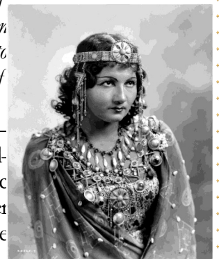
Stella Roman in the title role as Verdi's Aida

Stella Roman (23 August 1904 – 12 February 1992) was a world-renowned Romanian operatic soprano whose career brought her leading roles in Italy and the United States.