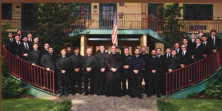
2020 - Seminarians - 2021 Diocese of Lafayette, Louisiana

Please drop them a note and maybe even place an order. You will not be disappointed.