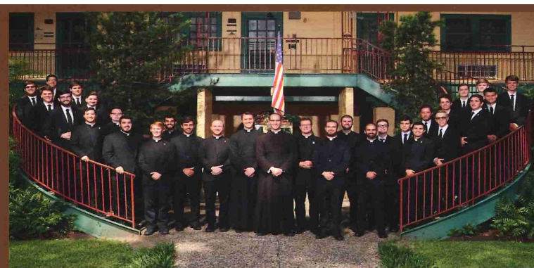
2020 - Seminarians - 2021 Diocese of Lafayette, Louisiana

Please drop them a note and maybe even place an order. You will not be disappointed.