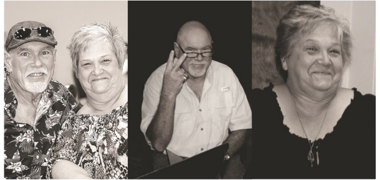
IBERIA SWAMP BAND & IBERIA COMMUNITY BAND